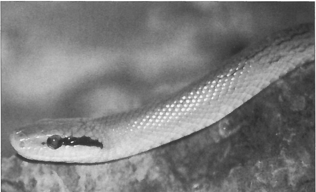
Elaphe taeniura taeniura .

Azemiops resembles a colubrid snake with its round head, large head scalation, long tail and round pupils. The largest known specimen was 70 cm long. Regarding its reproduction, it is only known that it is egg laying (Mehrtens, 1987; Grzimek, 1973; Engelman and Obst, 1981). Its venom and its mode of action is also