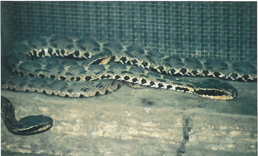
Agkistrodon blomhoffi siniticus .

Apart from a single reticulated python ( Python reticulatus ) most of the snake species on display were endemic to China. Most snakes were housed in very bare enclosures and were in poor and lean condition. There were terraria with several Natrix species, with Elaphe mandarina and Elaphe moelendorffi , cobra's and several Agkistrodon species. I had expected something like that, in a country where snakes are more often found on a menu than in a suitable terrarium.