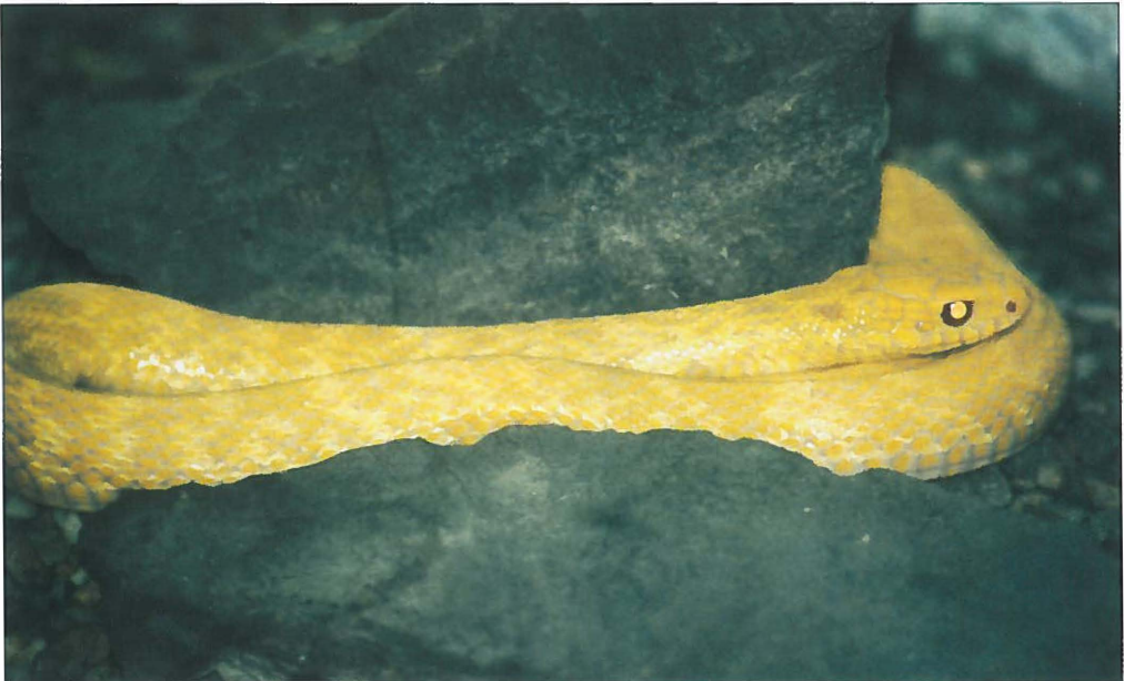
Elaphe carinata .

bag closed quickly and the man fled. Apparently some kind of surveillance had been seen. Later on we encountered the same man on another spot and the snakes could then be seen and photographed. Each species was separately packed in a kind of tough net curtain through which the snakes, mainly small venomous snakes, could be seen. There were several Agkistrodon , Dinodon , Natrix species and some cobra's ( Naja naja atra ). These were not large snakes meant for consumption but probably animals destined for use in traditional medicine. In a large store we saw several dried snakes that were sold as a cure for different illnesses. The pieces of snake were ground before the eyes of the buyer so one could be sure of the right species and buying some real snake!!