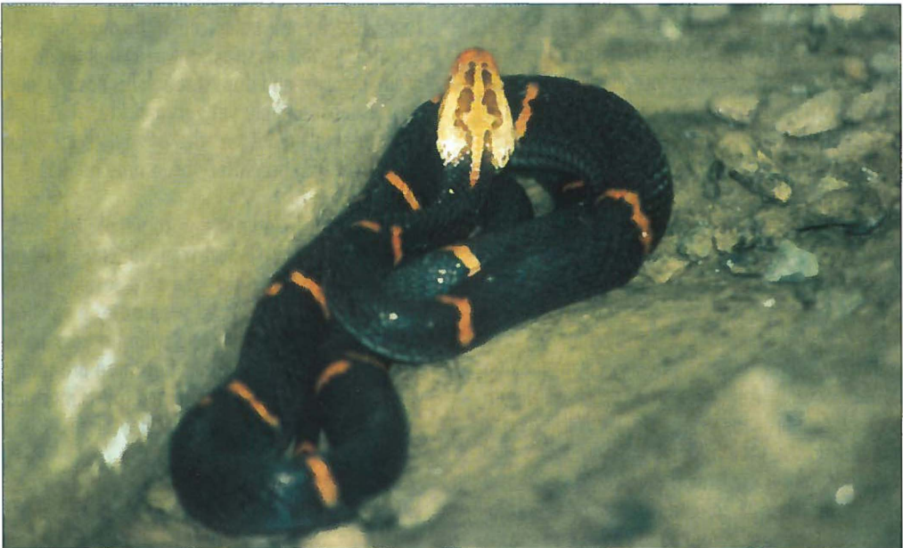
Azemiops feae.